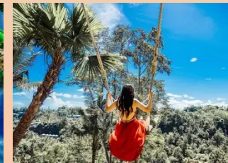
BALI SWING INDONESIA